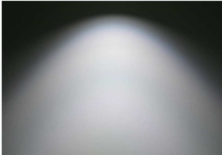
Leading Volumetric (cloudy plastic) diffuser